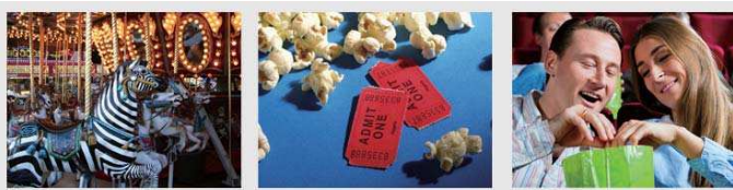
AMUSEMENT PARK TICKET